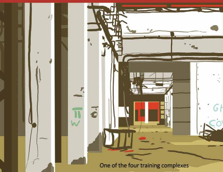
One of the four training complexes