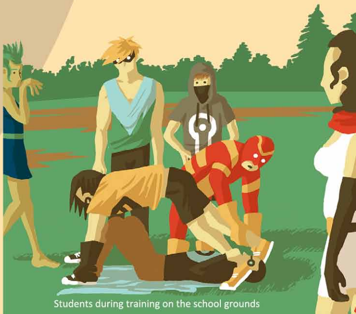
Students during training on the school grounds